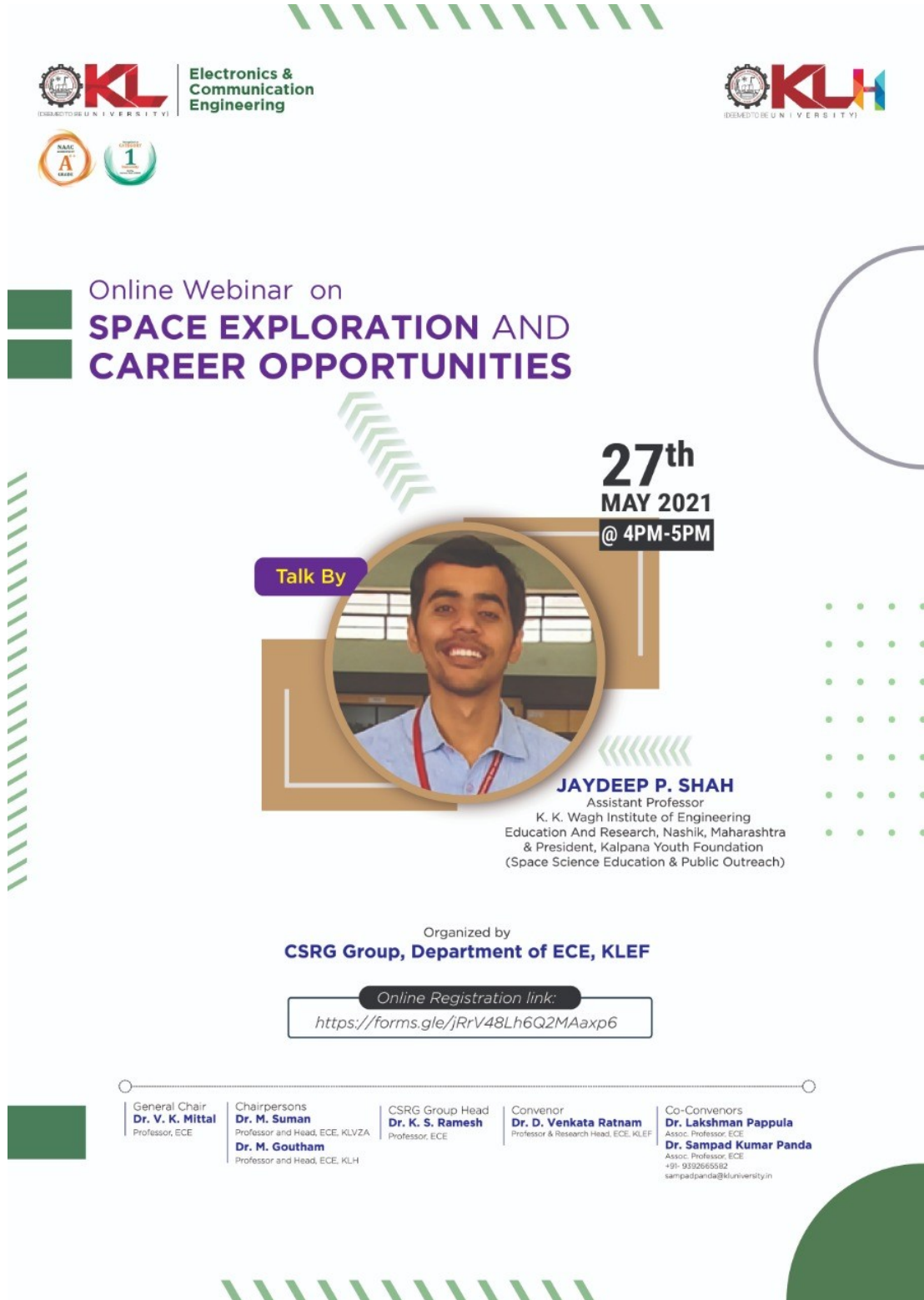
Fig. Poster of webinar